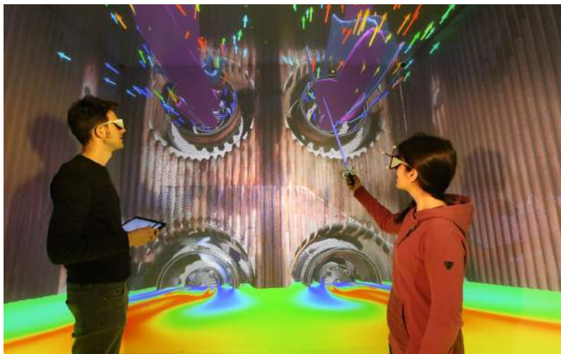
Stuttgart-based company RECOM Services uses HPC for computational process optimization and problem analysis in industrial combustion.

Identifying these cross-area intersections was one of the main objectives of the first EU HPC CoE workshop in Frankfurt. Many CoEs address specific HPC application areas such as Life Sciences, Earth Sciences, Material Sciences, and Engineering. However, other CoEs focus on computational approaches as tools to address challenges across multiple application areas, such as Machine Learning, Code Performance Optimization, and Data Analytics. “With the help of the GA and other support activities”, project coordinator Guy Lonsdale states, “we aim to bring these competences together and support the CoEs to find synergies that help them more effectively fulfill their pivotal role within a globally competitive EU HPC ecosystem”. In the coming months, the CoEs will work together towards their common goal to make today’s largest-scale applications fit for tomorrow’s challenges.